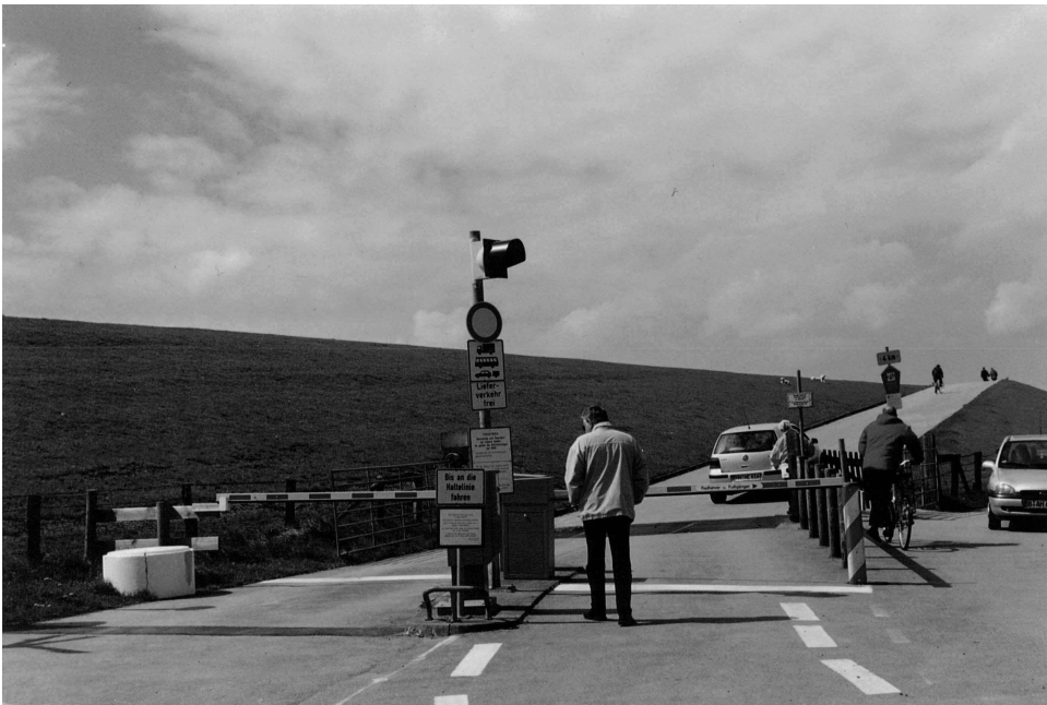
Figure 6.1 The border between nature and culture is a quandary for philosophers, a result of negotiations for anthropologists, and a 5 euro expense for citizens who want to pass it.

As an anthropologist interested in these conflicts, I travelled literally back and forth from the National Park administration to local communities, and between the National Park territory and the inland, desperately trying to make sense of the borders between nature and culture which played such a crucial role in this conflict. As it turned out, I found the answer in the movement itself, by driving in my car from one side to the other. One day, it came to me as a shock that I had indeed literally crossed the border between culture and nature when trying to get to a small Hallig – a miniscule island which was a leftover from the damage done by a previous storm surge (see Figure 6.1). This Hallig was accessible via a dam across the tidal flat area. Before entering this dam behind the dikeline, one had to stop at an electronic barrier. In order to lift the bar and pass through, the driver has to pay five euros. And it was exactly here where I realized one day that I had finally found the border between nature and culture: it was